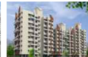
Dreams Veeroday, Kharadi