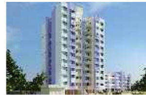
Dreams Solace, Hadapsar D, E & F Wing MahaRERA Reg. No. P52100001538