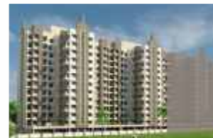
Dreams Lynnea, Wagholi A & B Wing MahaRERA Reg. No. P52100000237