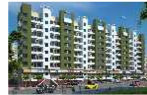
Dreams Rachana, Hadapsar C & D Wing MahaRERA Reg. No. P52100000273