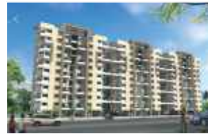
Dreams Elegance, Hadapsar A Wing MahaRERA Reg. No. P5210000411