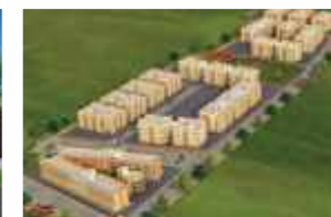
Dreams Nivara, Urali Kanchan