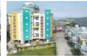
Dreams Rhythm, Bavdhan