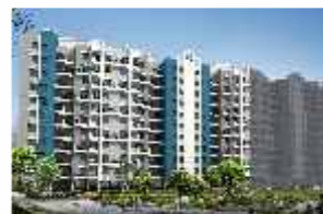
Dreams Wisteria, Pisoli A & B Wing Recd. Completion Certificate