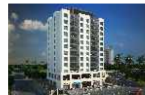
Dreams BelleVue, Bavdhan D Wing MahaRERA Reg. No. P52100000248