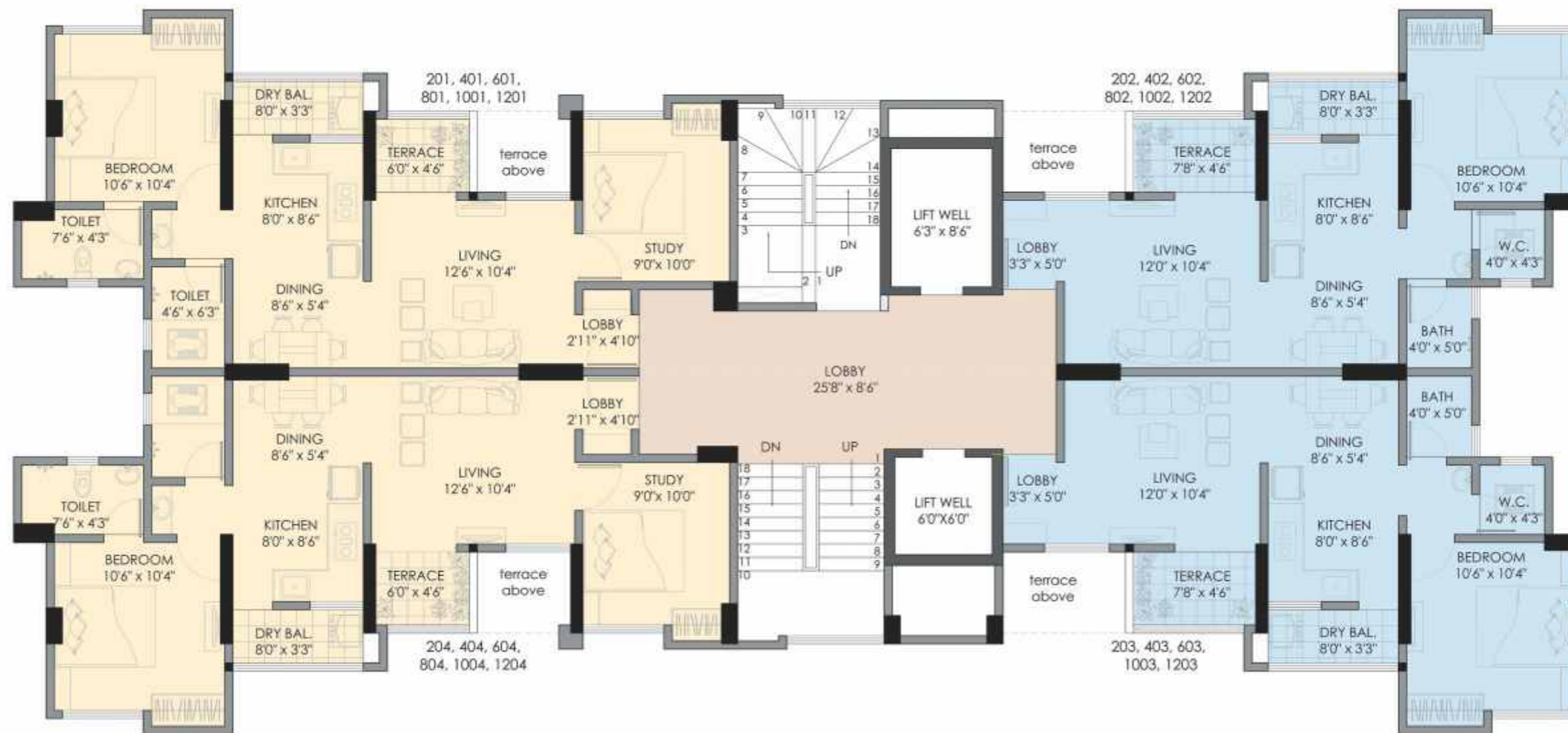
'C' WING (P + 12 FLOORS) EVEN FLOOR PLAN