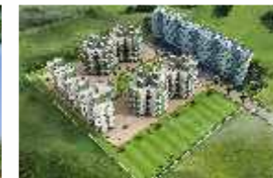
Dreams Sankalp - I, Wagholi