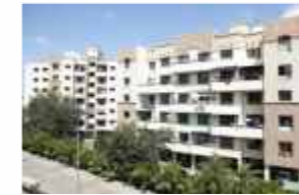
Dreams Residency, Vishrantwadi