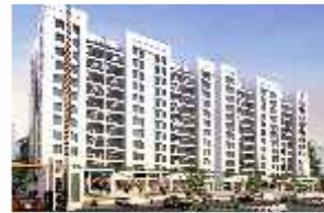
Dreams Onella, Hadapsar B Wing MahaRERA Reg. No. P52100002409