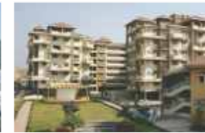
Dreams Estate, Hadapsar