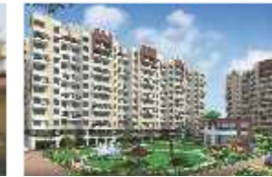
Dreams Elina, Hadapsar