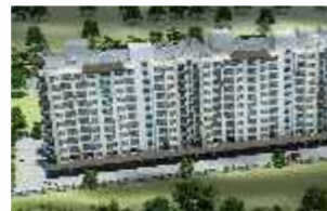
Dreams Ragini, Manjri A & B Wing Recd. Completion Certificate