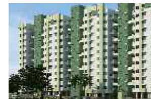
Dreams Sankalp, Wagholi L & M Wing MahaRERA Reg. No. P52100001529