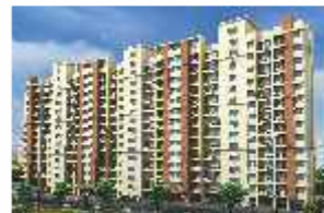
Dreams Avani, Manjri C Wing MahaRERA Reg. No. P52100000157