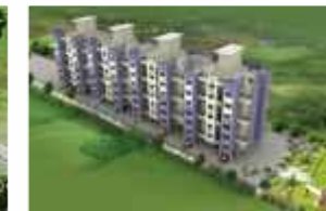
Dreams Solace, Hadapsar