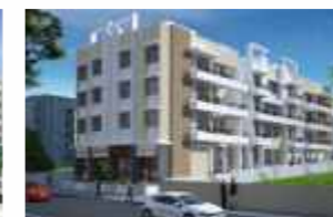
Dreams Camellia, Bavdhan