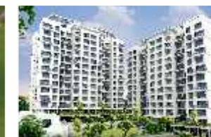
Dreams BelleVue, Bavdhan