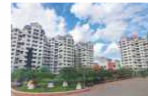
Dreams Aakruti, Hadapsar